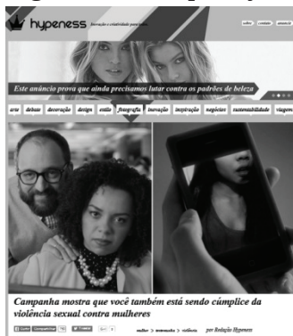
Figure 1 – Complicity

The videos from the #whowillyouhelp campaign were initially hosted on Youtube 7 and later posted on social networks, being commented (Figures 1 and 2) by sites like “ Hypeness – criatividade para todos ”, which did it with the title “Campaign shows that you are also being an accomplice of sexual violence against women” 8 , and Catraca Livre , with the heading ““Everyone is accomplices of violence against women’ affirms campaign” 9 ”