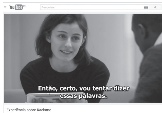
Figure 3 – Racism in Lithuania

A second example concerns a campaign conducted by an advertising agency in Lithuania, Eastern Europe, to denounce the existence of racism in that country. Here we have once again an irritation – violence personified in racism – that both emerges and disaggregates society, with the difference that it directly affects a device of the media system. This occurs as the video is developed on the initiative of a Lithuanian 10 site, which uses the problematic 11 to a) give visibility to its own actions and b) denounce the problem in that country.