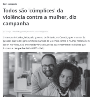
Figure 2 – Campaign