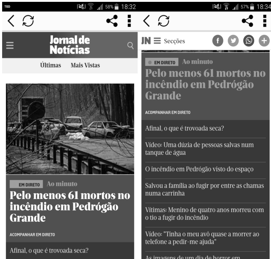
Figure 1 - Screenshots of the JN Mobile Web of June 18, 2017

During Sunday, June 18, JN updated its readers about the uncontrolled flames, balances of the number of victims and survivors, fire brigade mobilizations and rescue teams, witness reports and official reactions. Updates came in as breaking news notifications, direct flashes from reporters on the field, and continuous updating of the homepages of the website and mobile Web as well as the JN application. The digital platforms kept a deep red background as a warning sign under the “Fires” label.