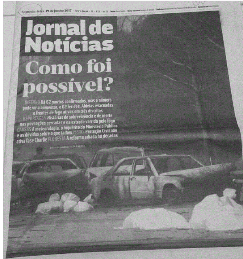
Figure 2 - JN printed edition of June 19, 2017

others trying to escape vehicles. The edition dedicated 26 of its 49 pages of informative content (seven pages were of advertisements), or 53%, to the coverage that displaced professionals from almost every desk of the paper during the day on Sunday.