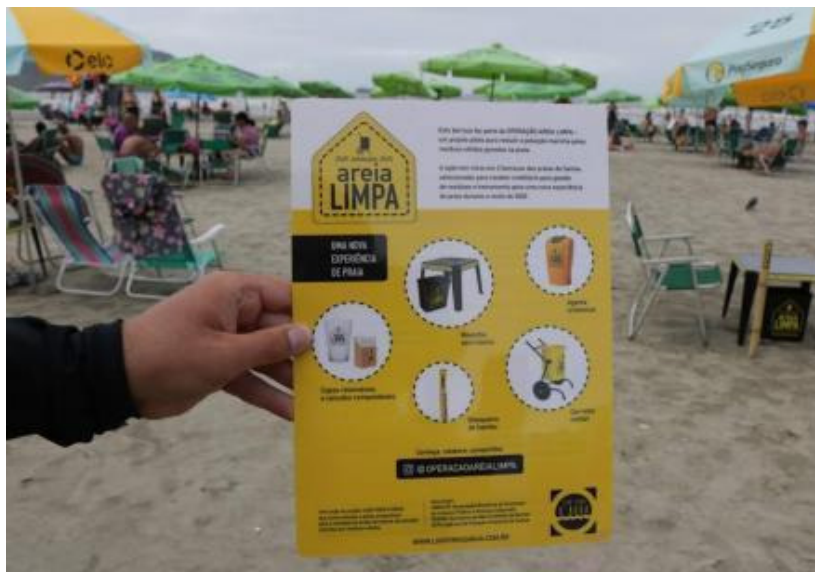
Figure 2: Brochure from the Clean Sand Operation