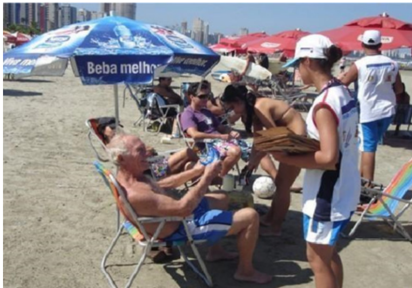
Figure 1: Distribution of bags and brochures on the beaches of Santos