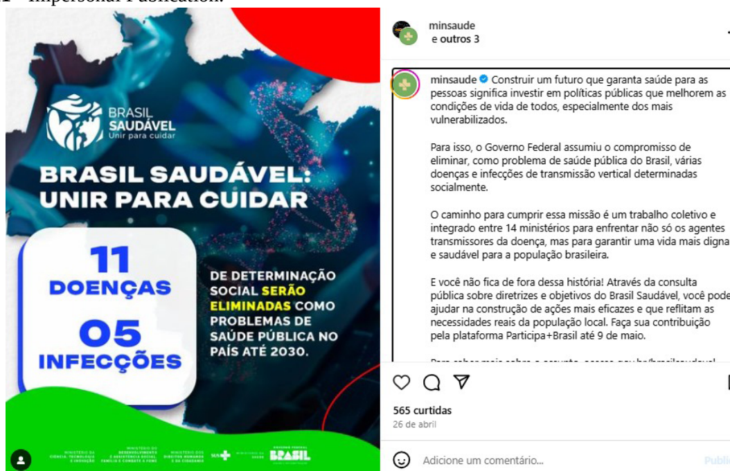
Figure 11 - Impersonal Publication.