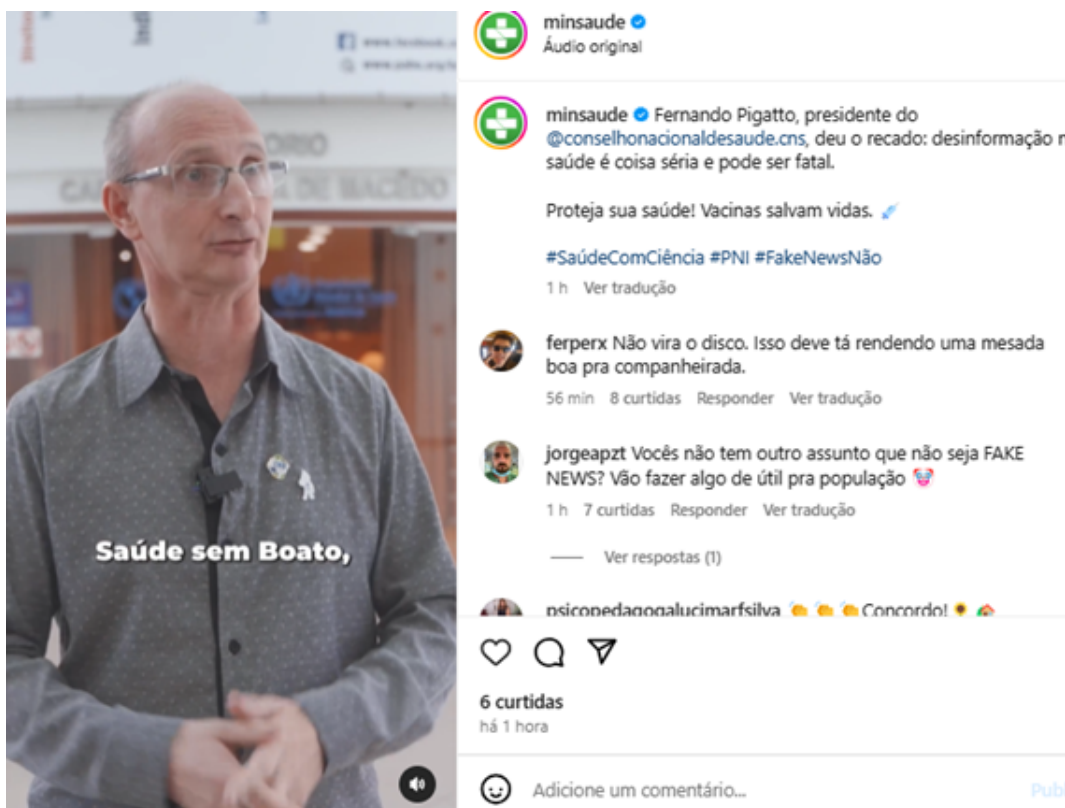
Figure 9 - Publication against misinformation.