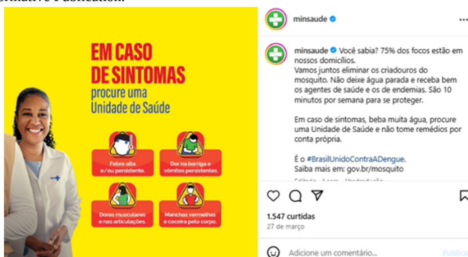
Figure 4 - Informative Publication.