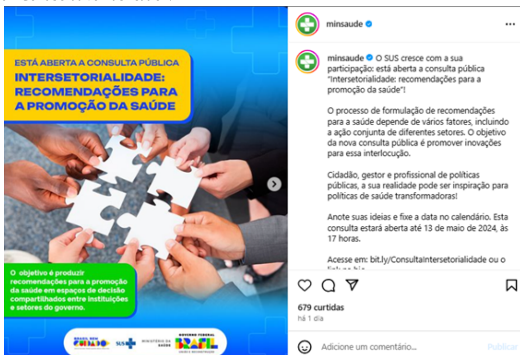
Figure 10 - Collaborative Publication.