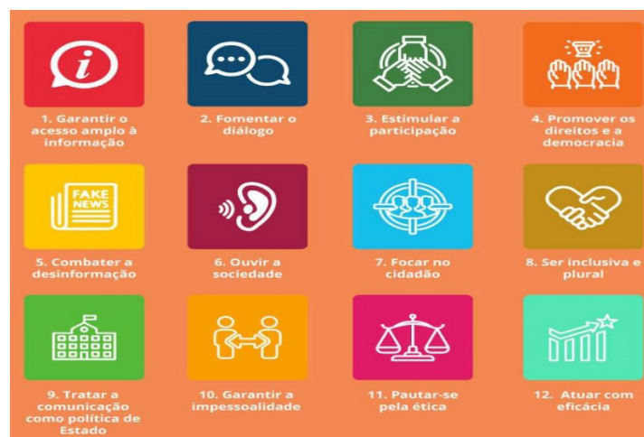
Figure 1 - Principles of Public Communication.

By bringing the concepts of e-participation models analyzed by Reddick (2011) into the field of Governmental Communication, it becomes possible to relate them to the twelve principles of Public Communication, as presented in Figure 1.